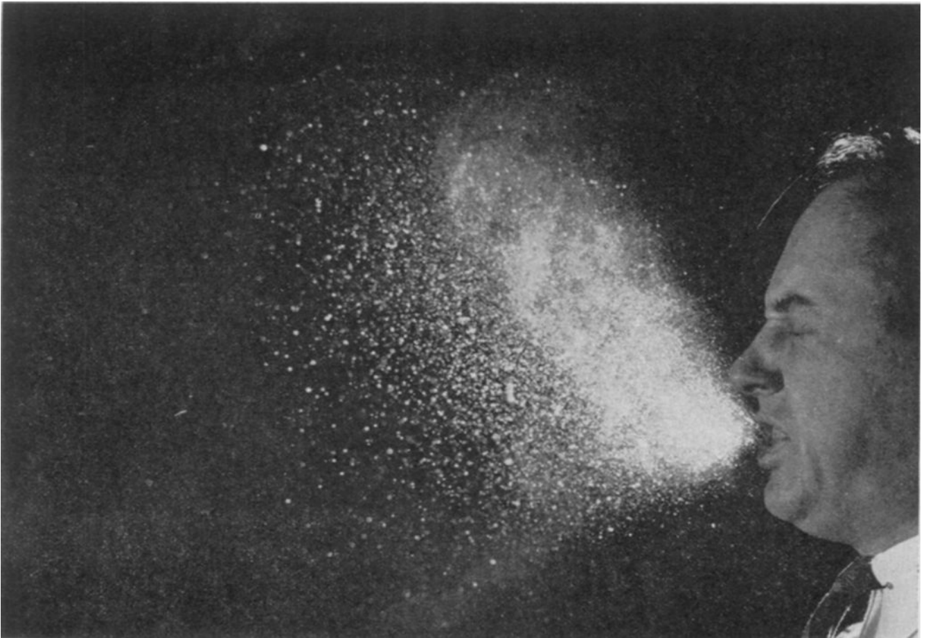
Fig 1 | Short range still imaging of stages of sneezing, revealing the liquid droplets from the 1942 Jennison experiment. 5 Reproduced with permission

Yet eight of the 10 studies in a recent systematic review showed horizontal projection of respiratory droplets beyond 2 m for particles up to 60 \mu\text{m} . 7 In one study, droplet spread was detected over 6-8 m (fig 2). 2,8 These results suggest that SARS-CoV-2 could spread beyond